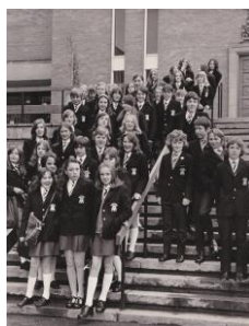
1973 saw the School become comprehensive, and non-fee paying, and GIRLS arriving