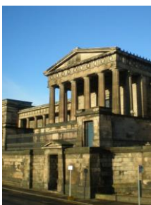
The 1829 Regent Road building, its splendid Portico looking out over Edinburgh