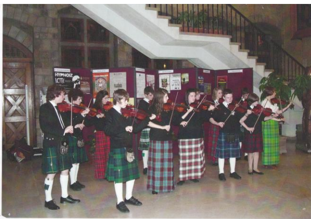
2008 Nov 11 th – in The Town Hall of Ypres in Belgium after playing at the Menin Gate. We were invited to an official reception by the town Mayor.

The RHS Club has also been very pleased to be associated with the group, their presence now being a fixture at the Annual Dinner.