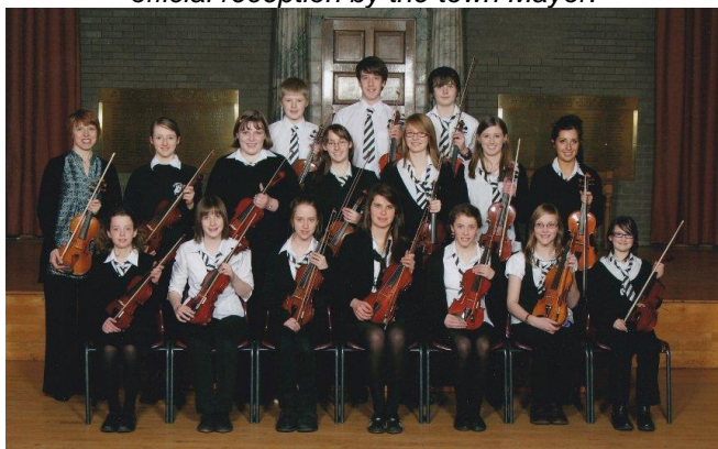
Fiddle Band 2010