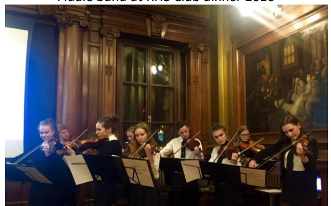
At City Chambers, 2018