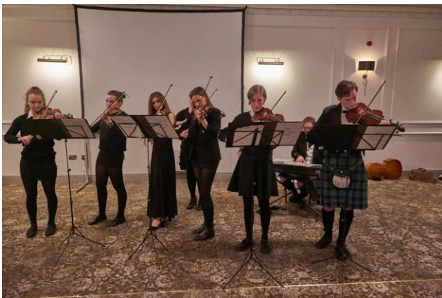
2018 RHS Club Dinner