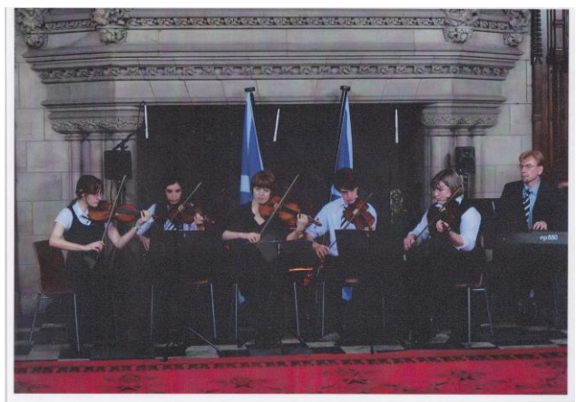
2009 Nov 16 th - At the great fireplace at Edinburgh Castle