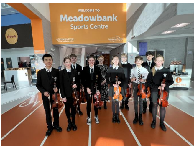
2022 Nov 4 th - the Official Opening of Meadowbank Stadium

June Nelson reports that the RHS Fiddle Group was asked to play at the 4th November Official Opening of Meadowbank Stadium. The stadium had been open and operational for a couple of months but due to various consequences the opening was delayed until November. The Fiddle Group played for most of the morning a variety of bright, upbeat Scottish pieces to entertain the VIP's and visitors. It was memorable and enjoyable occasion for all.