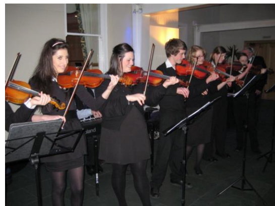
Fiddle band at RHS Club dinner 2010