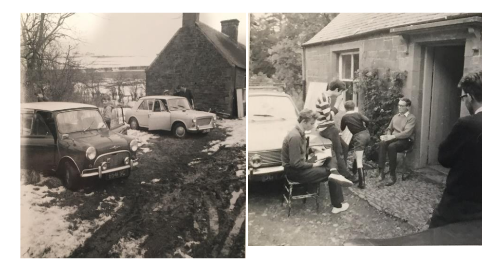
1969 March - Seagull Patrol camp at a snowy Lauder