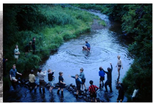
1971 Cubs in the river, making a brave attempt to drown themselves