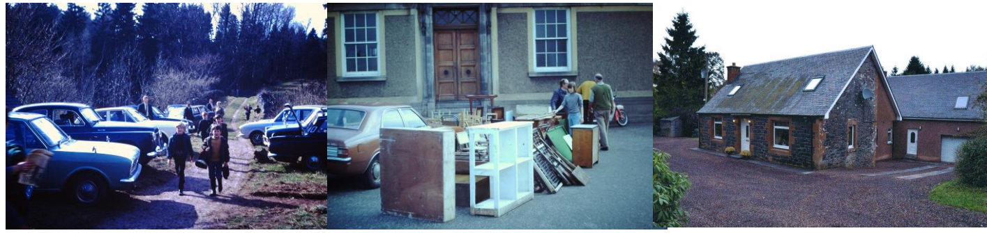
1970 Cubs and parents' visitation. No lack of motor cars!