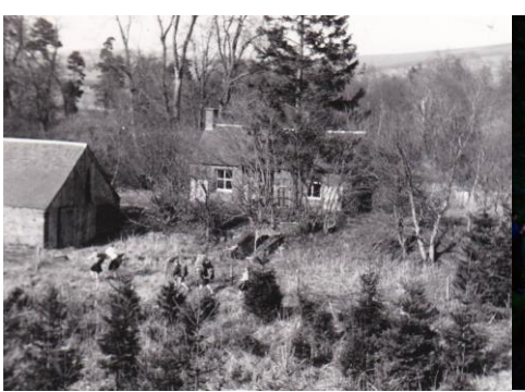
1964 April – Drummonds Hall from the SW showing the sawmill lade tunnel