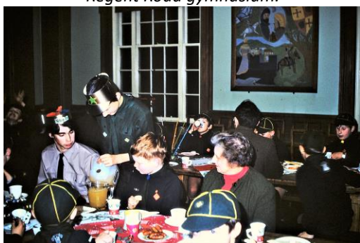
1970 – Cubs Christmas party in Northfield Broadway – Miss Hamilton right foreground