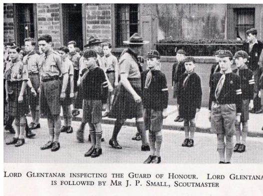
1949 October 15 th , Memorial Hall in Tower Street Portobello dedicated. Lord Glentanar inspects the group