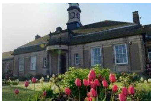
The Royal High Primary School, opened in 1931, welcomed the Cubs that year