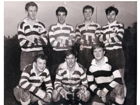
1964 Goldenacre Sevens winners post-match