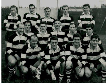
1963-64 FP XV versus Trinity Academy