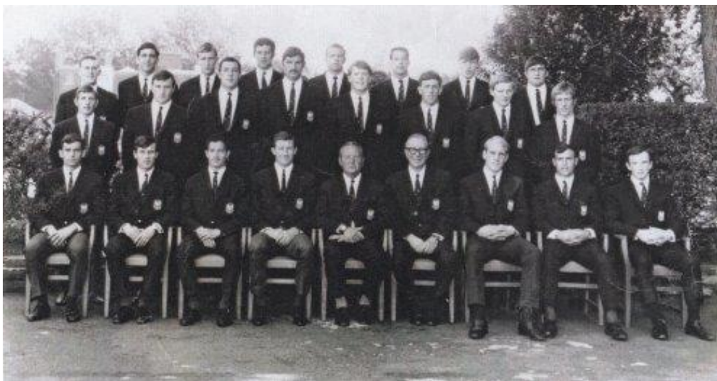
1969 Scotland tour of Argentina – official photo