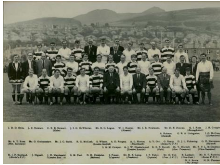
1967 FP's V Scotland