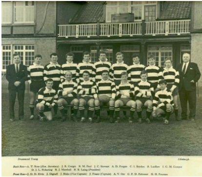
1966-67 FP XV