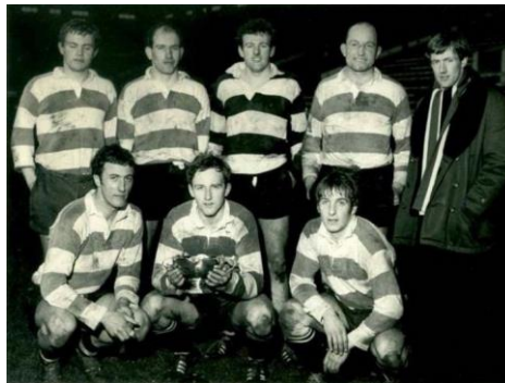
1969 Murrayfield Sevens