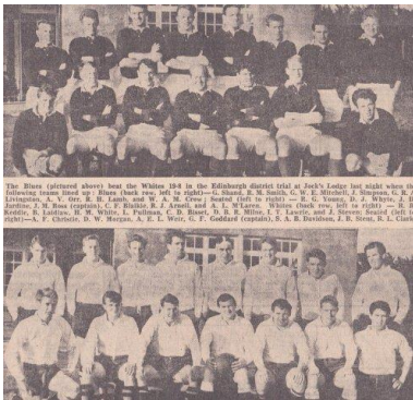
1969 Edinburgh rugby Trial