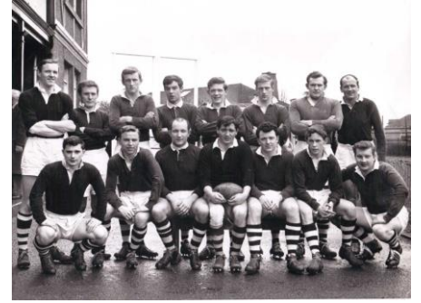
1964-65 1st XV match - unknown opponents