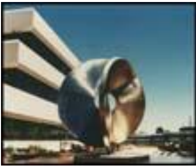
NEXUS - Royal Executive Park, Rye, New York