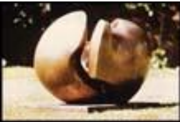
BRASILIA Bronze, 30cm, edition of three