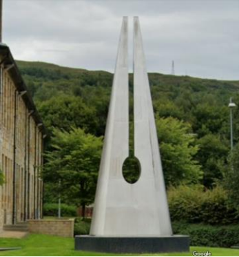
ASPIRATION - Riverside Business Park, Greenock