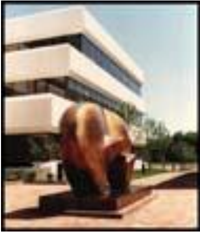
COVENANT - Royal Executive Park, Rye, New York