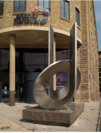
QUESTOR - Godwin Street, Bradford, West Yorkshire