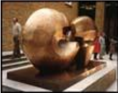
ENCOUNTER NCC-Guys Hospital, London