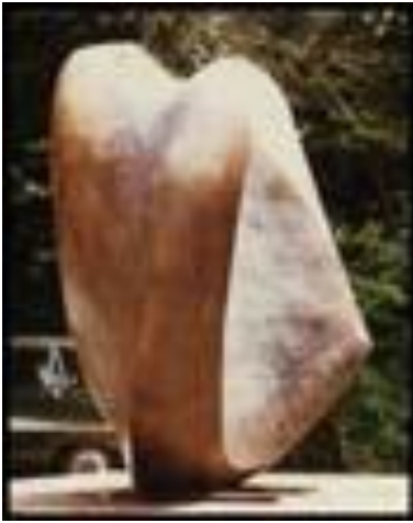
JUPITER Cophthorne, Sussex