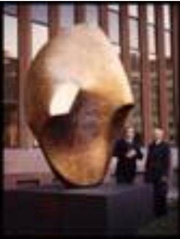
RIDRICH Wingate Centre, London