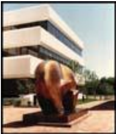
COVENANT - Royal Executive Park, Rye, New York