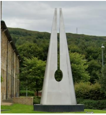
ASPIRATION - Riverside Business Park, Greenock