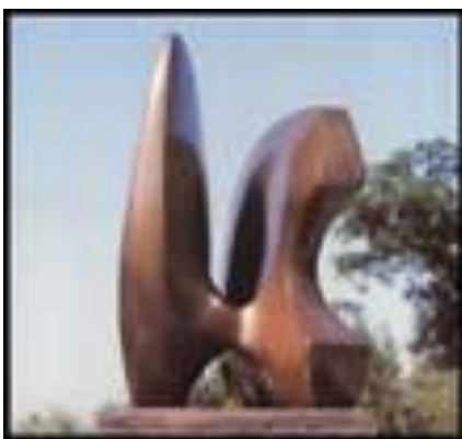
EPSILON - Bronze, 42cm, edition of three