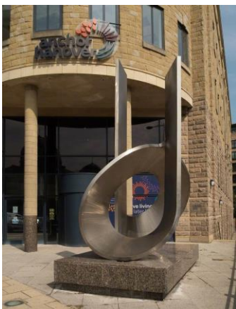
QUESTOR - Godwin Street, Bradford, West Yorkshire