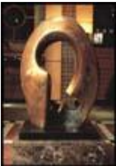
ORACLE - Vegans Mill, Docklands, London