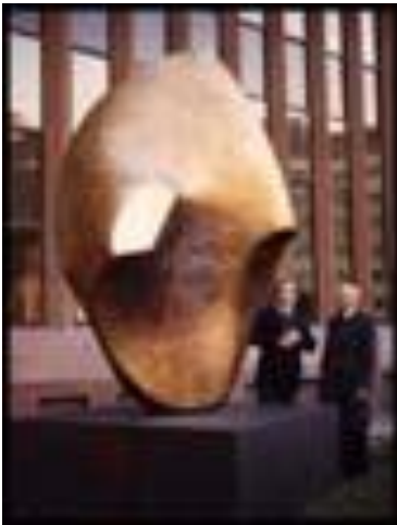
RIDRICH Wingate Centre, London