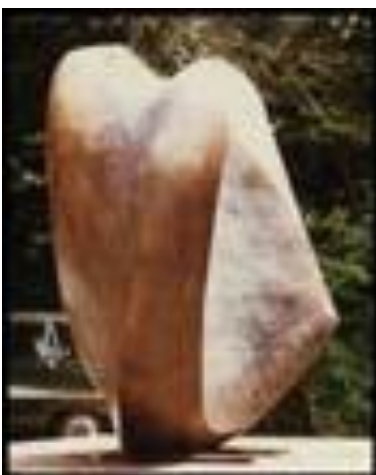
JUPITER Cophthorne, Sussex