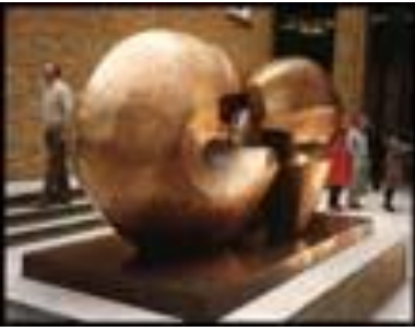
ENCOUNTER NCC-Guys Hospital, London