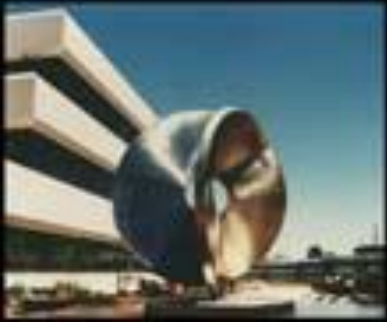
NEXUS - Royal Executive Park, Rye, New York